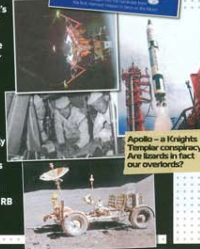
Apollo - a Knights Templar conspiracy? Are lizards in fact our overlords?